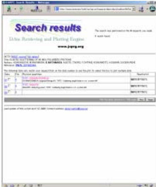
NRDF search/plot (DARPE)