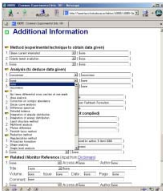
NRDF/EXFOR editor (HENDEL)